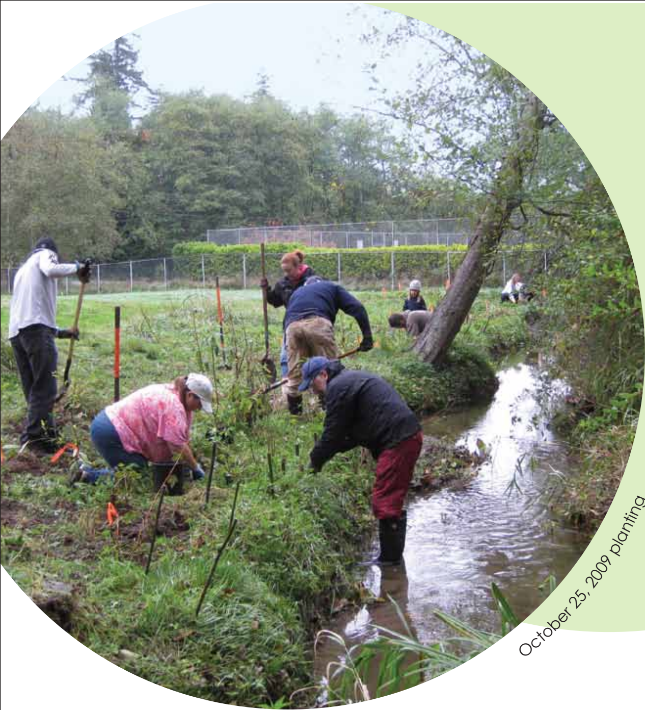
October 25, 2009 planting

Last fall, you helped plant trees and shrubs along Walker Creek