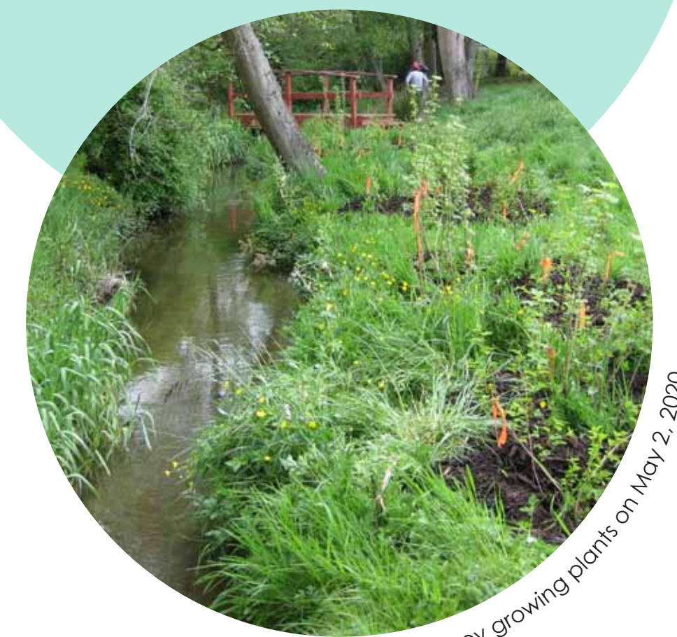
Happy growing plants on May 2, 2020