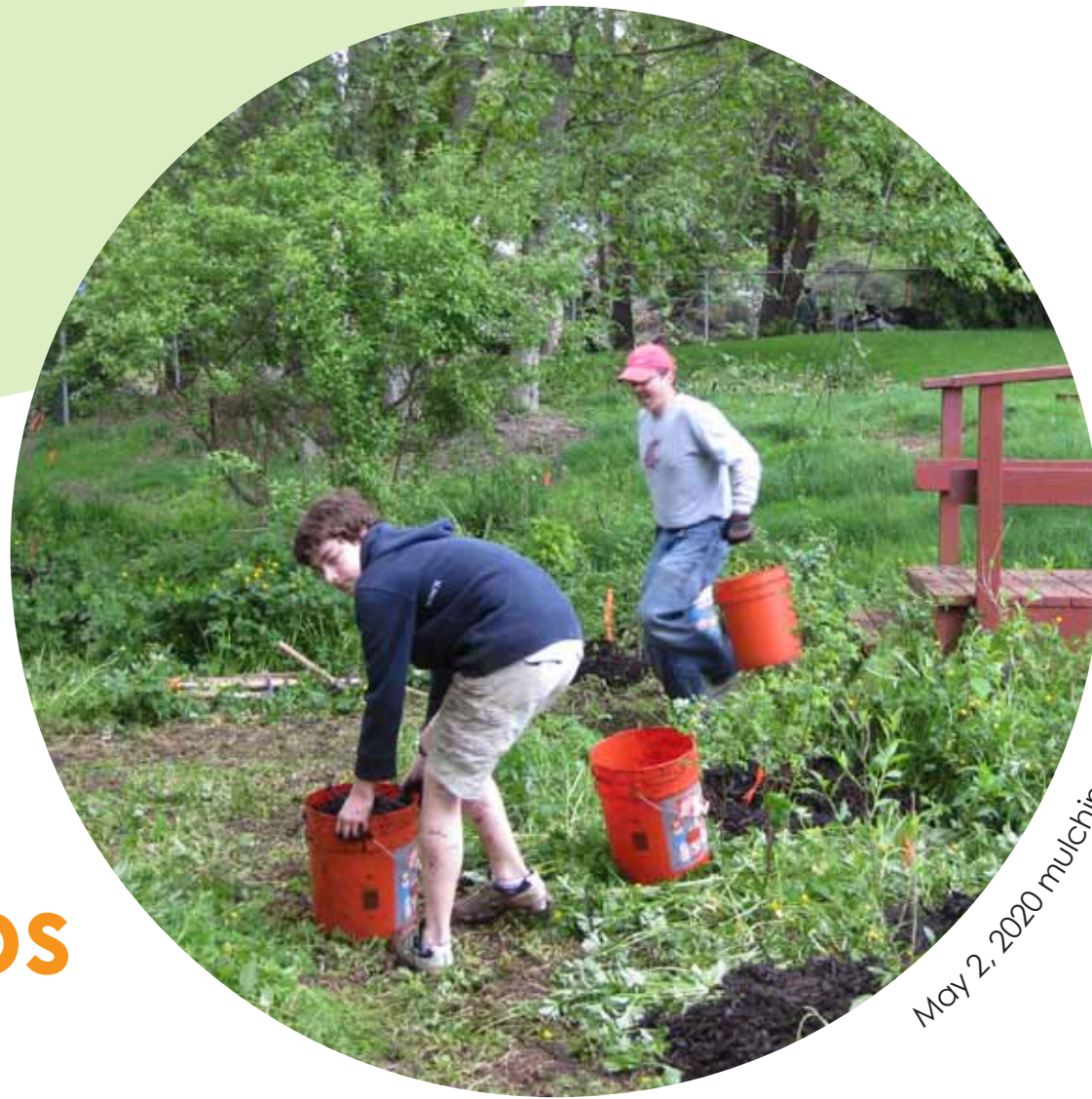
May 2, 2020 mulching

Last fall, you helped plant trees and shrubs along Walker Creek